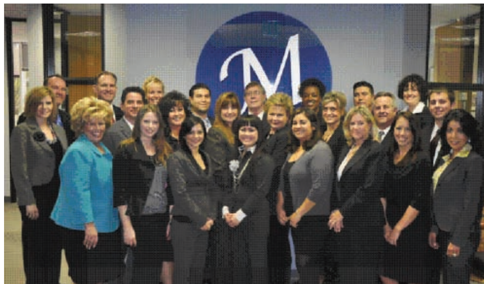
Mattson Resources has established themselves as a premier source for growing businesses in the region

Mattson Resources Orange County offices are conveniently located in the Metro Point Towers at Metro Point Center in Costa Mesa. For more information, please call (714) 881-1850.